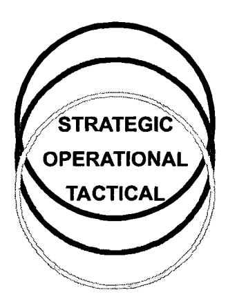
Figure 2. The Levels of War Compressed.

The distinctions between levels of war are rarely clearly delineated in practice. They are to some extent only a matter of scope and scale. Usually there is some amount of overlap as a single commander may have responsibilities at more than one level. As shown in figure 1, the overlap may be slight. This will likely be the case in large-scale, conventional conflicts involving large military formations and multiple theaters. In such cases, there are fairly distinct strategic, operational, and tactical domains, and most commanders will find their activities focused at one level or another. However, in other cases, the levels of war may compress so that there is significant overlap, as shown in figure 2. Especially in either a nuclear war or a military operation other than war, a single commander may operate at two or even three levels simultaneously. In a nuclear war, strategic decisions about the direction of the war and tactical decisions about the employment